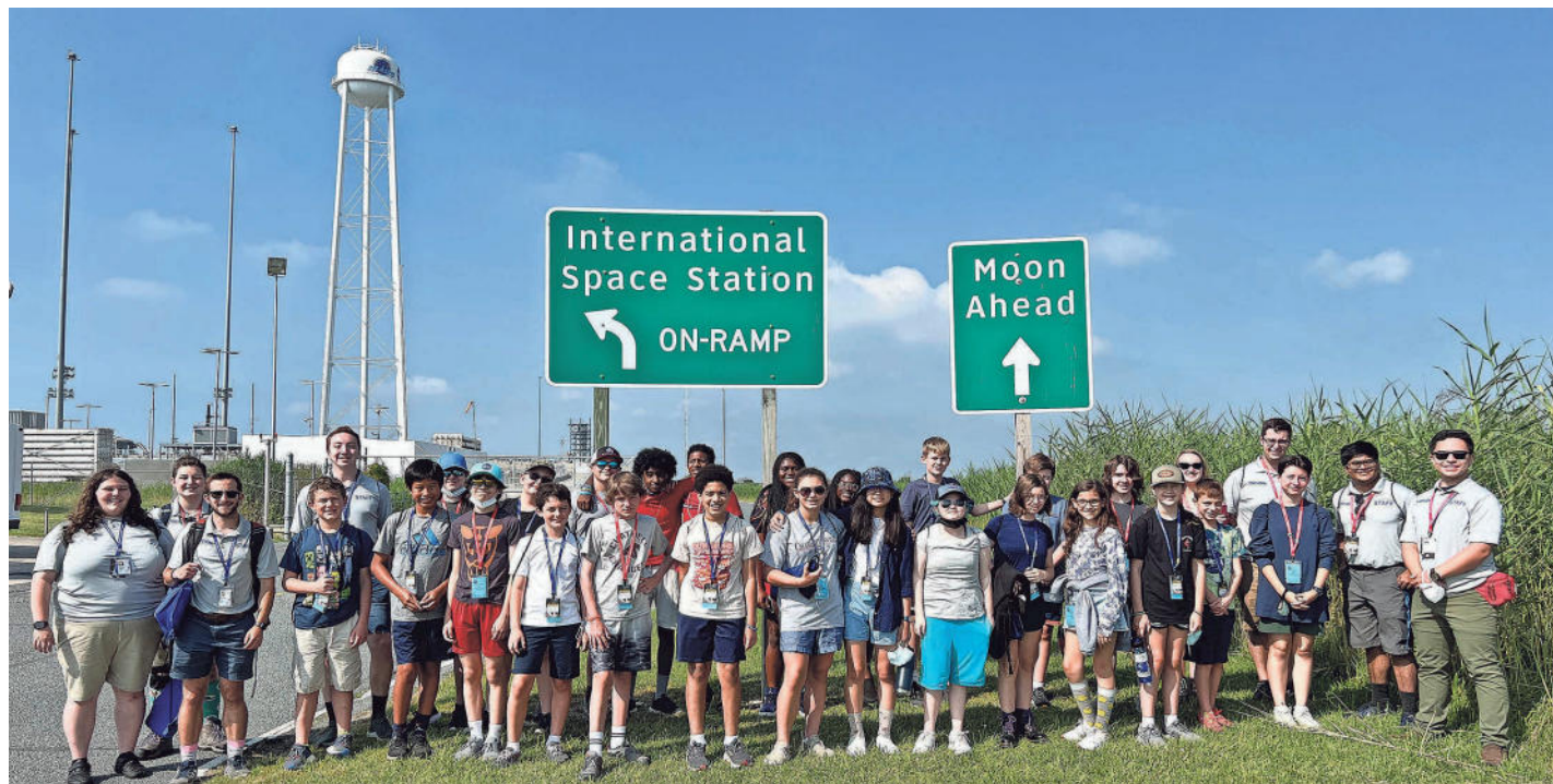
Space campers and counselors take photos after a tour of Virginia Space's Mid-Atlantic Regional Spaceport Pad OA at NASA's Wallops Flight Facility on the Eastern Shore of Virginia.